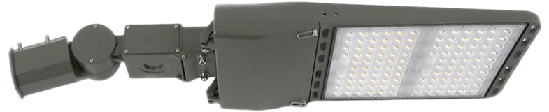
Option 2: 3 Arm 120 Degree Bullhorn (10036)