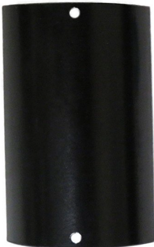
Handhole Cover and Screws